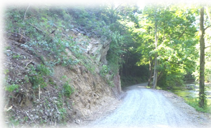
Moose Road, Jackson Township