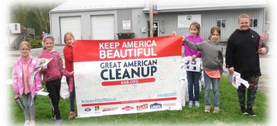
Earth Day festivities hosted at the historical Clark's Ferry Tavern in Duncannon on April 23