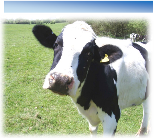
A curious dairy cow on green pasture

The Pennsylvania Resource Enhancement and Protection Program (PA REAP) is a State Tax Credit program administered by the Pennsylvania State Conservation Commission (SCC). The District offers fee based assistance to farmers seeking help with completing an application and determining BMP and plan eligibility. The District charges a fee of $50 to verify three or less REAP BMPs, and $100 for four or more REAP BMPs per application and/or required plan, as well as a $150 fee per plan reviewed for completeness. In 2022, the District verified plan completeness for 2 operations as well as meeting with 7 farmers to discuss what plans they need to have in order to be eligible for REAP.