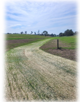
Grass growing up through the straw netting on a grassed waterway