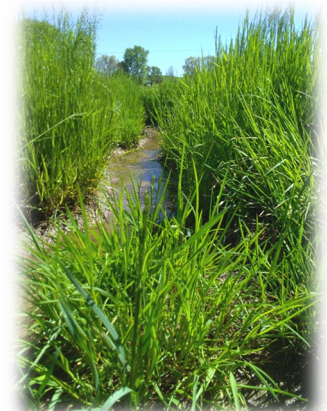
The start of gully erosion in a pasture that was fixed by shaping a parabolic waterway