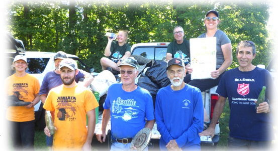
Scenes from the Shermans Creek Clean-up and our awesome volunteers all together on September 1