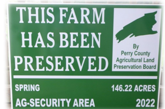
The Martin family Farmland Preservation sign