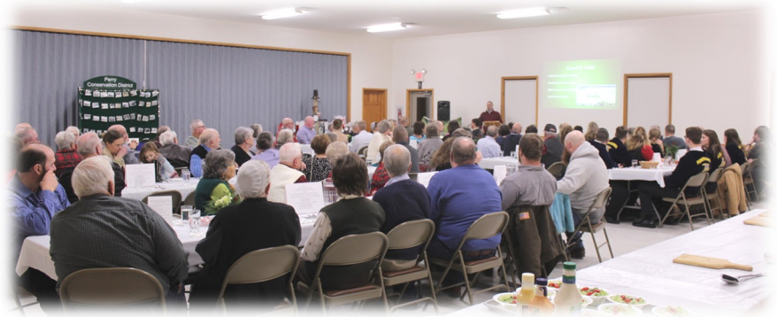
The banquet crowd of 114 attendees celebrates 10,000 Acres of Farmland Preservation at the Perry Mennonite Reception Center on the evening of December 12

Perry County leads the State in the amount of donated easements, coming in at 2,991.92 acres. In total as of December 2022, there are 71 farmland easements with 10,076.35 acres preserved. Of those, there are 2,991.92 acres in donation, 3,950.02 acres in State purchased, and 3,134.41 acres in Federal purchased. There are 44 operation types represented on these preserved farms which are 8 crop, 16 dairy, 8 poultry, 10 beef, 1 sheep, and 1 swine. The Farmland Preservation Program accepts applications year-round with ranking usually taking place each fall. The combined efforts of all of the landowners who have committed their farms to the program have made this endeavor highly successful since its establishment in March of 1990.