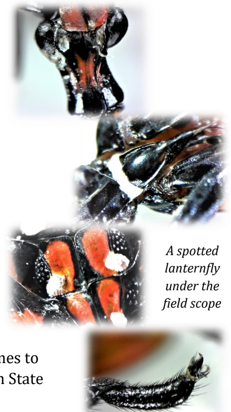
A spotted lanternfly under the field scope

The District was a recipient of a Pennsylvania Department of Agriculture grant in the fall of 2021 to monitor the population of Spotted Lanternfly (SLF) in the eastern part of the County and provide outreach to residents which continued through 2022. 18 additional circle traps were purchased with left-over grant funding from last year. These and the on-going supply of sticky trap accessories and educational signage were distributed throughout the County to residents and businesses on an as needed basis upon their request. Higher populations of SLF were observed in the circle traps and sticky traps throughout the Marysville, Duncannon, and Newport areas. In correspondence with the Pennsylvania Dept of Agriculture, it is estimated that the SLF populations in our area will peak within the next two years. After that time, we will hopefully begin to see a steady drop in their numbers as they move west. Information on how to 'help stop the spread' was also sent out within our 2022 District Summer Newsletter and was posted several times to our District Facebook page. The District also worked with our local Penn State Extension office and Master Gardeners to distribute SLF Management Manuals, ID cards, and fact sheets on how to check vehicles before the transfer of this invasive species occurs.