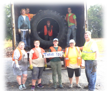
Tire War volunteers at the Oliver Township building in Newport on September 17