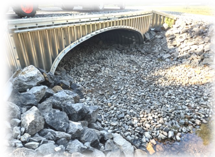
Green Valley Road, Tyrone Township

During 2022, three Dirt and Gravel Low Volume Road projects were completed. Green Valley Road in Tyrone Township implemented a stream crossing replacement project, having installed a 19'4" x 4'3" structural plate culvert with a bottom. Homestead Road in Juniata Township also completed a stream crossing replacement project where a 6' x 2'9" aluminum plate arch culvert was installed. Moose Road in Jackson Township placed 1,827 tons of driving surface aggregate to the road, applied 730 tons of road fill to establish a proper crown, installed a French Mattress to manage natural spring seeps, and installed a head-wall and an end-wall for all of the existing drain pipes. All three projects reduced the sediment and dust entering Perry County's streams while leaving each road more drivable and easier to maintain. The new stream crossing policy was discussed at the Quality Assurance Board meeting and it was decided that due to limited staff and liability concerns, stream crossing projects will be put on hold and re-evaluated in 2 years (December 2024).