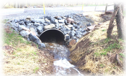
Homestead Road, Juniata Township