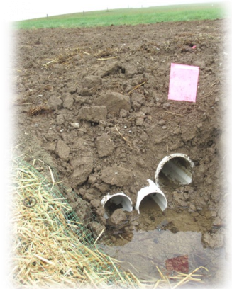
Subsurface drainage and footer pipes daylighting into the grassed waterway