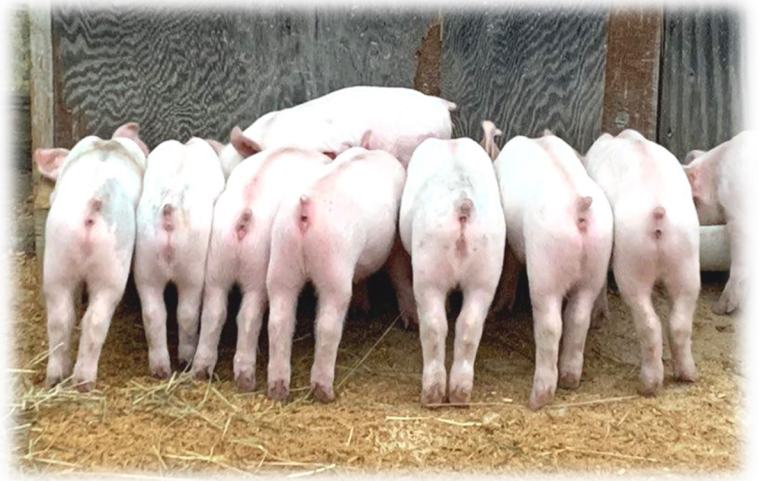
Well fed pigs lined up for dinner time

The Chesapeake Bay Program was created by the Department of Environmental Protection (DEP) to promote and facilitate the installation of conservation best management practices (BMPs) in the Bay watershed to support the Pennsylvania Watershed Implementation Plan efforts. Through this delegation agreement, the District provides technical assistance on an as needed basis, assists with REAP applications and associated BMP verifications, conducts 50 farm inspections to check that required agricultural plans are in place, receives and processes complaints, and offers educational outreach and workshops. Conservation Plans