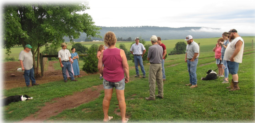
Members of the Perry County Grazing Group gather at the Rumberger Farm in Millerstown on August 4