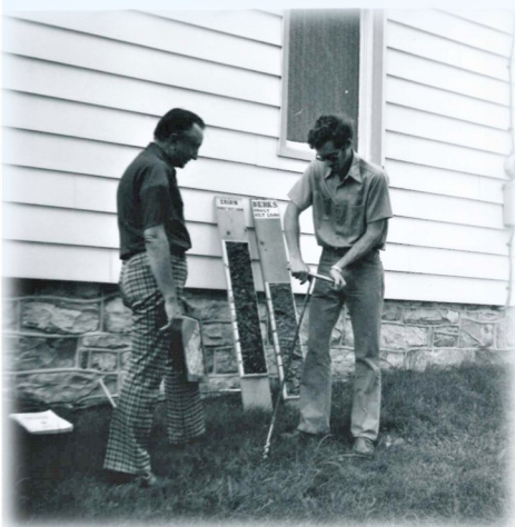
Soil scientists demonstrate a soil probe and display soil profiles for members of the public.