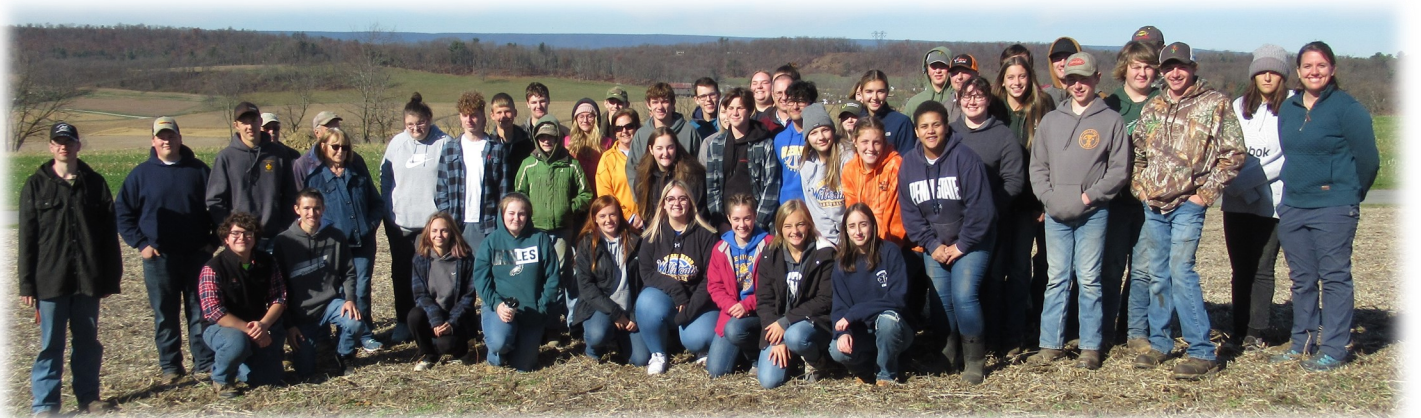
A beautiful day for a big group photo!