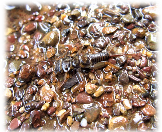
A happy little Stonefly Nymph in Shermans Creek