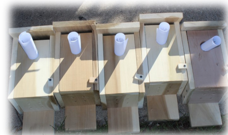
Hand-crafted Bluebird Boxes