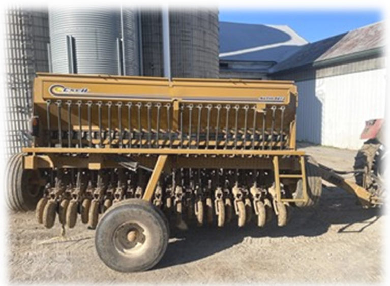
The new Esch No-Till Drill, purchased with funding from the County-wide Action Plan Grant allocation in the spring of 2022

The District has four No-till Drills that are available to be rented out to residents in Perry County. We have two John Deere 10 foot drills, a 2017 JD 1590 and a 2022 JD 1590 Pro Series, and a 12 foot 2022 Esch 5612 no-till drill. Both drill types are primarily used for reseeding large crop fields either to be harvested for grain, silage, or to serve as cover crops destined to be used as a green manure. Large pastures may also be planted with these drills so long as the gates are wide enough for the drills to fit through. The fourth no-till drill is a smaller Land Pride LP 606 with a 6ft wide grain bin that is convenient for reseeding pastures, small crop fields, and small hayfields. While this drill can plant the same grain or cover crop seeds as the larger John Deere and Esch no-till drills, it has an additional seed bin for planting a wide variety of light and fluffy native grasses such as Brome or Kentucky Blue Grass. The practice of No-till helps to keep the soil intact, improve water infiltration and water retention, retain nutrients for the next crop to be planted, keeps the soil biology active between primary crop harvests, and reduces the presence of weeds. In 2022, the No-till Drill Rental Program planted a total of 1,570.65 acres in no-till throughout the County. 606.1 of those acres were in cover crops.