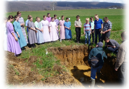
The local Clarks Run Mennonite School joined in to do some learning in the field at the Hoover Farm