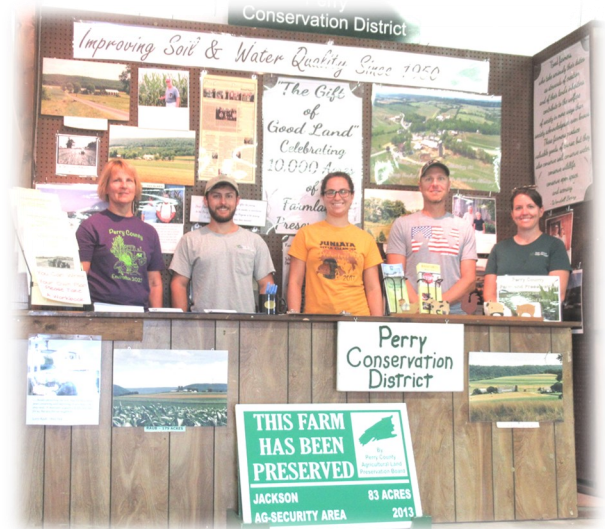
2022 District display "Celebrating 10,000 Acres of Farmland Preservation" at the Perry County Fair

We strive to reach more students and members of the public with our programs by participating in community events, providing in-classroom demonstrations, submitting press releases to the local newspapers, conducting presentations as requested, posting to social media, and uploading videos to our YouTube Channel. During 2022, we were able to provide 31 trainings with a total of 1,672 participants and conducted 37 mass outreach activities with the potential of reaching over 94,258 individuals. This year, we achieved a special milestone, as our Farmland Preservation acres reached an impressive 10,000 acres. In celebration, we dedicated our 2022 Perry County Fair display in honor of those farms.