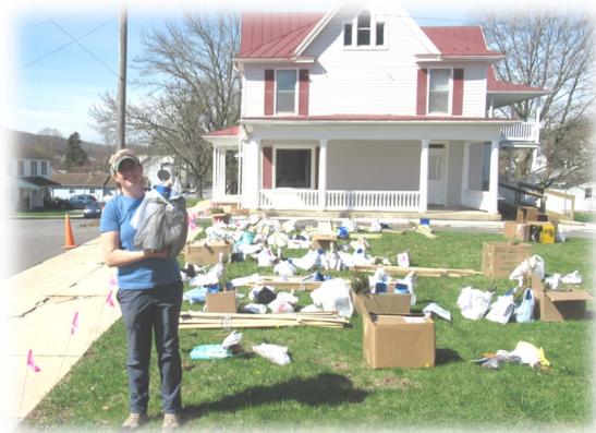
The yard is full of orders!

In 2022, we offered four types of conifers: Eastern White Pine, Colorado Blue Spruce, Norway Spruce, and Concolor Fir. The deciduous varieties that we offered were Eastern Redbud, Sawtooth Oak, Sugar Maple, Sycamore, and Tulip Poplar. We also sold Elderberry shrubs and Highbush Blueberry Plants. Under the umbrella of ‘Habitat Enhancers’ we offered a Northeast Perennial and Annual Wildflower seed mix, a Butterfly and Hummingbird seed mix, and an Oat seed variety for cover cropping in gardens and small plots. A customer favorite are the wooden Bluebird Nesting Boxes hand-crafted by the local West Perry FFA Chapter.