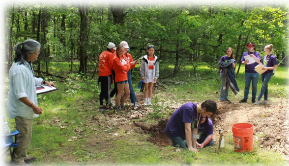
Team Perry at the State Envirothon Soils & Land Use Station, where they took 14th Place!